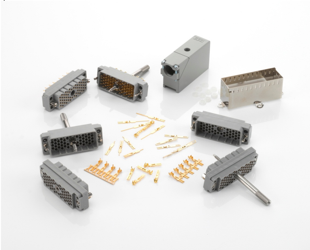
The 56 circuit version of the EDAC 516 connector series showing the EMI/RFI shielding device and metal cover. The plug and receptacle are both shown with either actuating screw or locknut. The hermaphroditic contact is available with crimp; solder eye; pcb or wire wrap tail.

They can be configured for cable-to-board/panel and cable-to-cable applications. The series features an actuating screw and locknut to facilitate mating and to provide a secure and robust interconnect. The screw and locknut can be fitted to either the plug or the receptacle.